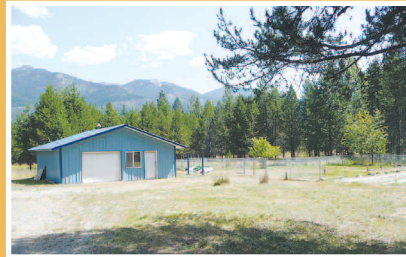
ONE ACRE WITH SHOP property has electricity, telephone and septic. Zoned and ready for your mobile home and all you need to do is dig a well. Nice views and close to rivers and lakes for your recreational fun. $59,000