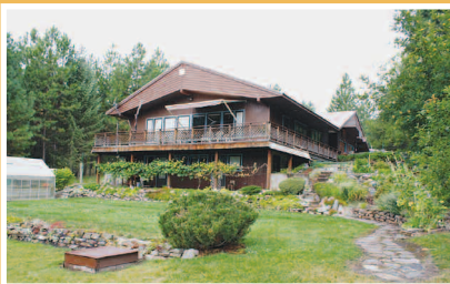
MILNOR LAKE FRONTAGE no motors allowed on this beautiful peaceful lake. Well built well maintained 3 bed, 2 bath home with an open kitchen to the living room for those fabulous lake and mountain views. Garage with attached shop, walk out basement with another kitchen set up, lovely landscaping, raspberry patch, fire ring, dock. You name it, it's here. $375,000