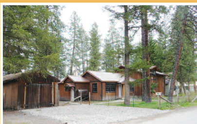
2 HOMES ON .43 ACRES , a 4 bedroom, 2 bath and a 1 bedroom, 1 bath. Both with excellent rental income. In addition there is an adjacent lot 275' X406' that can be purchased. Both the lot and the one bedroom home face U.S. Hwy 2. $149,900