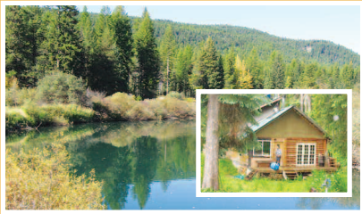
DARLING CABIN on 1.46 acres sitting above the Yaak River. Off the grid, has a generator, has a well, needs a septic and some finishing. Across from the cabin is 1.35 acres on the Yaak River. Cabin price $49,000 River price $40,000