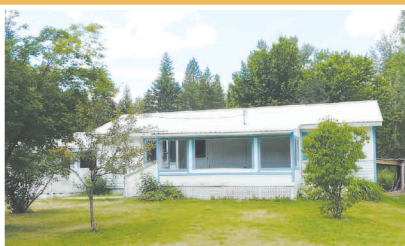
5 BEDROOM HOME on one acre with the best raspberry patch ever. New paint, living room has Pergo flooring, economical heating system with a wood stove room, fan and ducting into the home. Large open front porch with Libby Creek within walking. $129,000