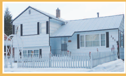
PRIDE OF OWNERSHIP shows in this lovely family home. Fun tri-level featuring 3 bedroom and 2 bathroom. New cabinets in the kitchen which opens to the dining area. A large fenced yard in the rear several carports and a double garage with work benches. As tidy as can be. $164,900