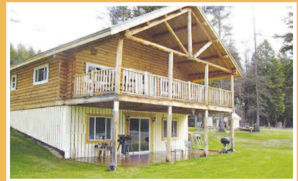
7 ACRES ON MIDDLE THOMPSON LAKE with over 7 acres of land including two docks, a 4,000 sq. ft. fenced garden, outbuildings, with easy access. This 2,178 sq. ft. log cabin has an open kitchen to the living room with terrific lake and mountain views. Do what you will with the huge finished walkout basement. A sportsman's dream come true. $399,000