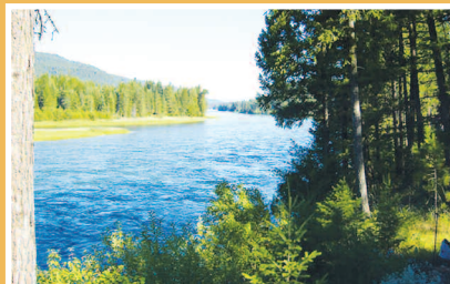
KOOTENAI RIVER FRONTAGE with 2.24 acres, 112' of riverfront and 390' of U.S. Hwy 2 frontage. Right, the land goes from the Hwy to the river for very easy access. There is a shop with an apartment, septic, well, electricity, and phone. Ready for you to build that Montana Home on the river. Lucky you, the price has been reduced to $177,000