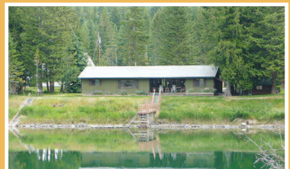
LIVE ON THE RIVER , the Kootenai River with a 3 bedroom, 1 1/2 bath home with a newer dock, roof, pellet stove and landscaping. The boat ramp is just down the street. Nice slower moving part of the river. Good fishing and floating here. Seller is ready to deal. $199,000