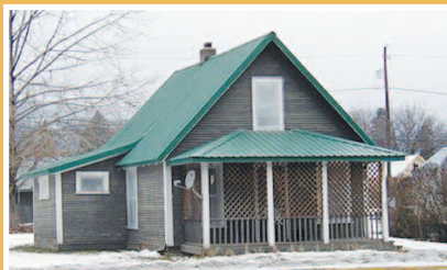
OLDIE BUT A CUTIE in fact there are two of them side by side. Each has all new plumbing for the sewer and two bedrooms one up and one down. They currently have good rental income and sit on Hwy 2 for a possible business location. Each is $40,000