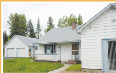
FLOWER CREEK FRONTAGE in this large 4 bdrm, 2.5 ba home with a living room, family room and huge laundry room. Sitting on 1.5 acres right in the city with a huge yard, oversized attached garage, storage shed and Flower Creek in the backyard. Possible Terms. $177,000